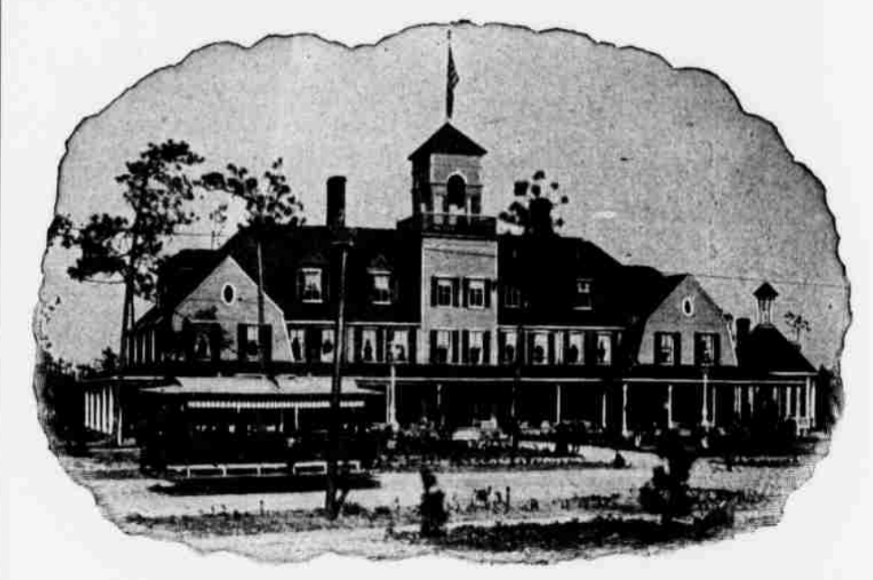
Terms: $3.00 a Day, $12 to $20 a Week.

THE HOLLY INN has been enlarged to meet the great de nand, and can now accommodate two hundred guests. Its attractions leave nothing to be desired on the score of comfort and convenience-Electric Lights, Steam Heat, Open Fire-places, Telephone, Solarium, Billiard Room, Orchestra, Central Courtyard, Elegantly Furnished and Carpeted Rooms and Unsurpassed Cuisine, with Table Service by carefully selected New England girls.