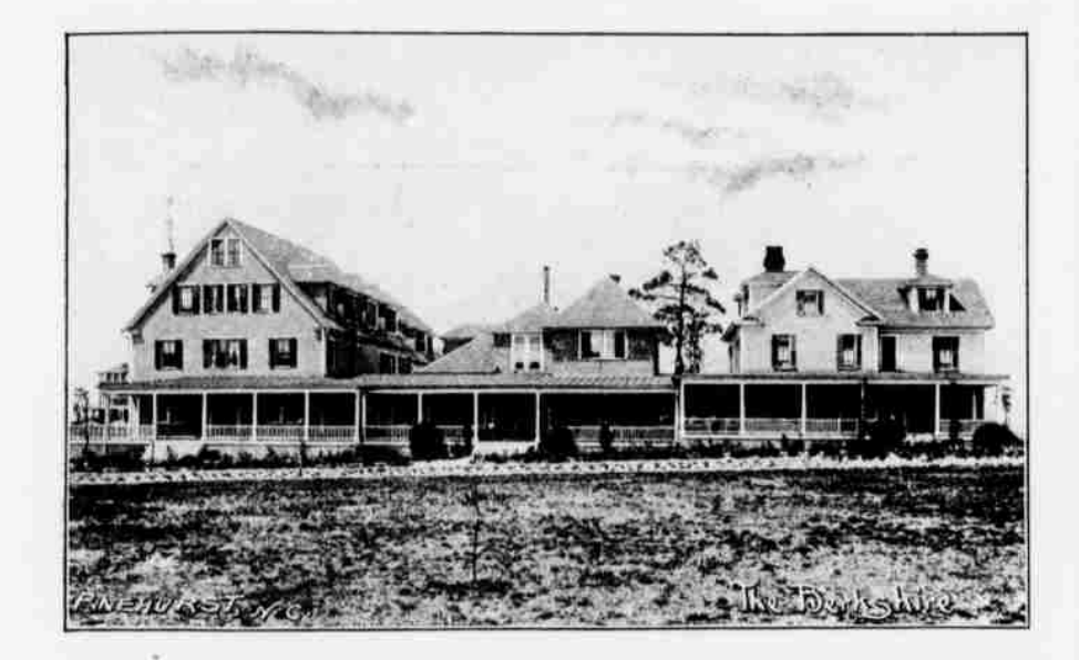
Pinehurst, N. C.