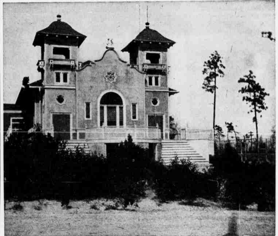
THE MUSIC HALL OF THE CAROLINA—THE SCENE OF MANY BRILLIANT SOCIAL AFFAIRS DURING THE SEASON.