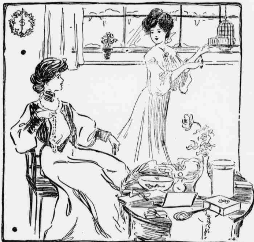
EXPERIENCE THE GREAT TEACHER.