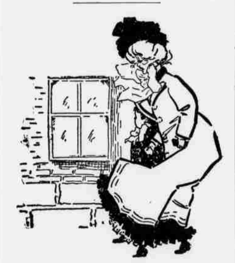
Hard on Papa.

Tommy-Say, ma, what made baby holler so much last night?