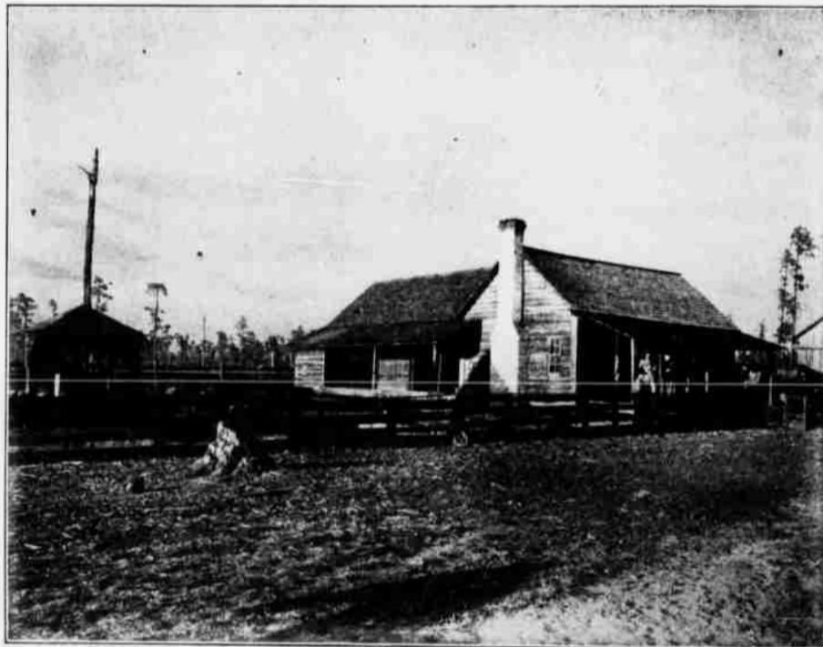
A NEARBY FARM HOUSE.