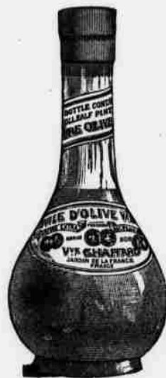
Full Half Pint