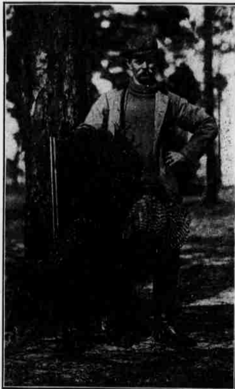
THE KING OF GAME BIRDS.