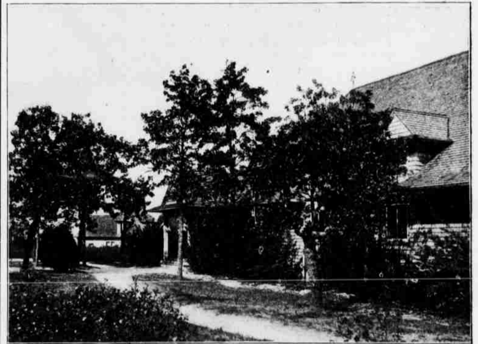
THE PINEHURST CHAPEL—FORMERLY THE VILLAGE HALL.

What almost might be termed a new departure, so marked has been the growth, is the Sunday school in which a large circle of young people and children have become interested as teachers and pupils. Renewed interest has also been