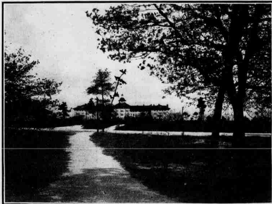
"GLORIOUS SUNSHINE SHEDS A WARM AND SUBTLE GLOW OVER ALL."