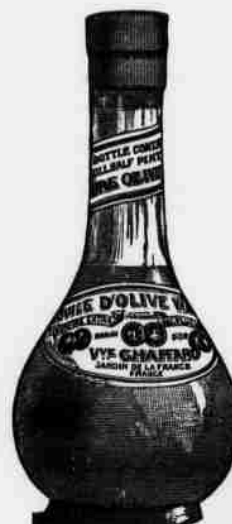
Full Half Pint

PARK & TILFORD, NEW YORK. S. S. PIERCE CO. BOSTON.