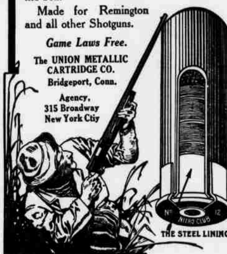
THE STEEL LINING