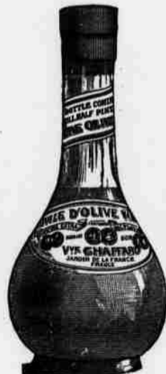
Full Half Pints