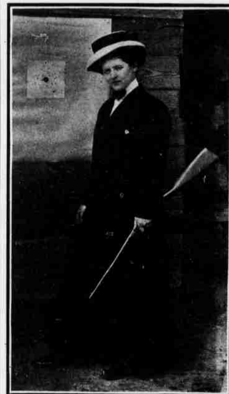
"ALL IN THE BLACK"