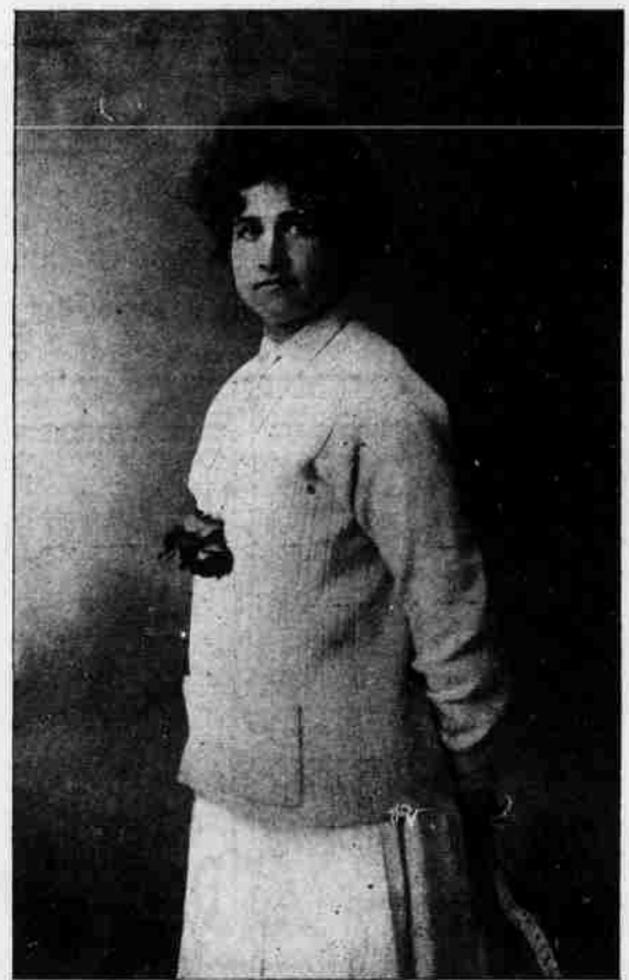
MISS MAY G. SUTTON