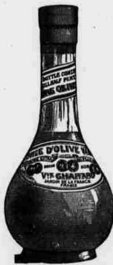
Full Half Pint