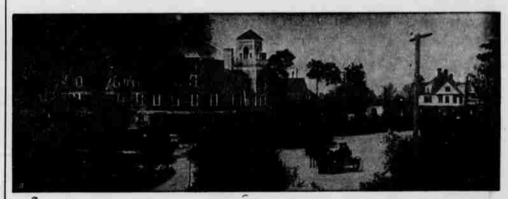
SEASON: JANUARY TO APRIL 30

The Holly Inn is one of the most comfortable, attractive and popular hotels in the South. With its annexes, the Radcliffe and the Magnolia, the hotel has accommodations for 200 guests.