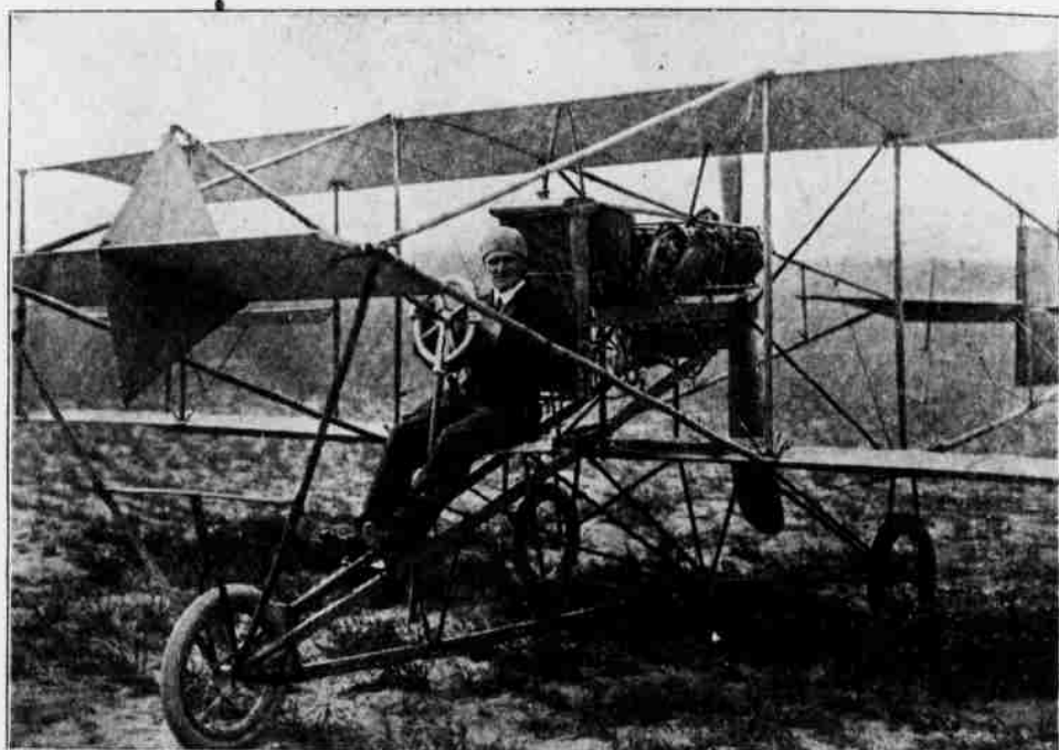
1910—LINCOLN BEACHEY AT PINEHURST—1910.

Showing What A Difference Ten Years Make