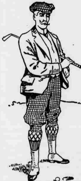
Small Size Non-Floater

New York, 30 Warren Street Boston, 143 Federal Street Philadelphia, 1201 Chestnut Street Chicago, Ill., 36 South State Street San Francisco, 46 Kearney Street.