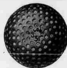
Small Size Non Floater