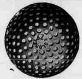
Medium Size Non Floater