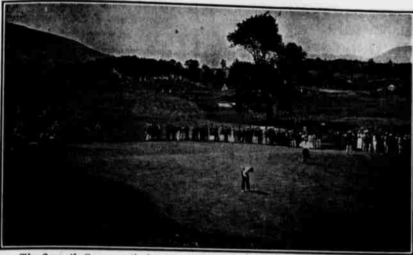
The Seventh Green on the beautiful Ekwanok Golf Course at Manchester, Vt. Grass Seed supplied by Stumpp & Walter Co. for Eight Successive Seasons.