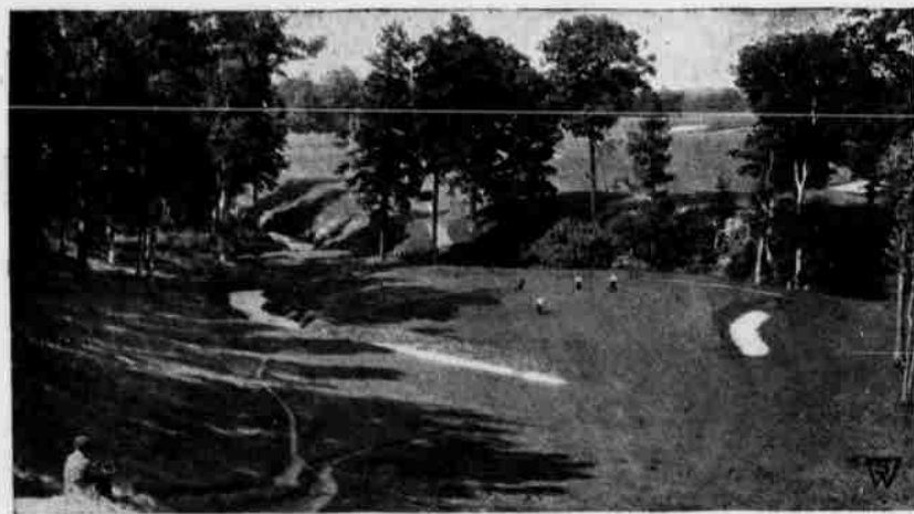
At the Greenwich Country Club, Greenwich, Conn., where the Women's Metropolitan Championship, as well as the Metropolitan Open, was held in 1920. Grass Seed for this course supplied by the Stumpp and Walter Co.