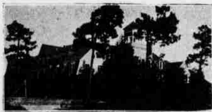
The Holly Inn: Every convenience; pleasantly located, liberally conducted.