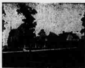
The Berkshire: A house of quiet friendliness and restful comfort.