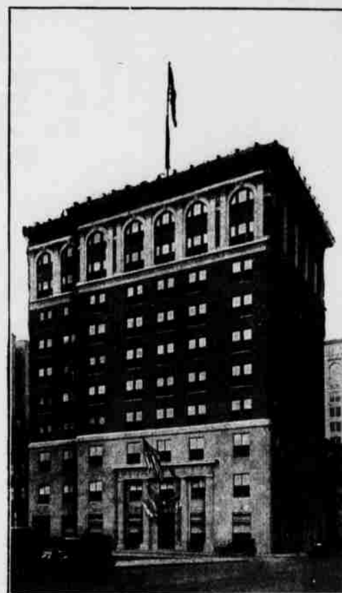
BROOKS BROTHERS' BUILDING

Convenient to Grand Central, Subway, and to many of the leading Hotels and Clubs