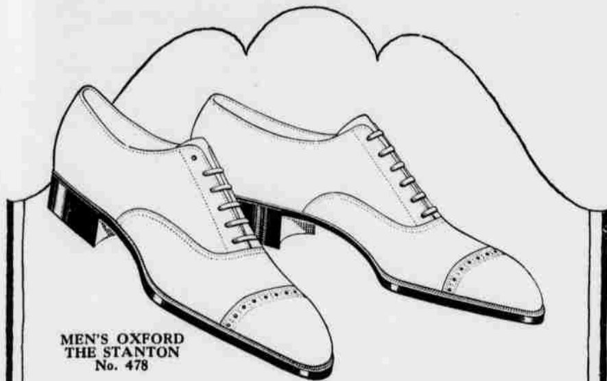
MEN'S OXFORD THE STANTON No. 478