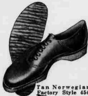
Tan Norwegian Factory Style 454

Imported crepe rubber soles that grip the turf and ground in dry or wet weather and are welcome on putting green or in club house.