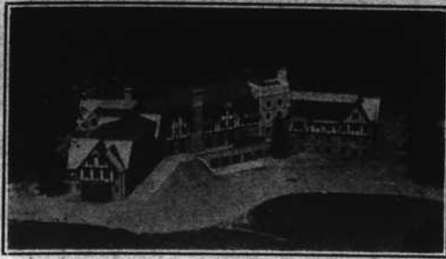
Air Glimpse of Sedgefield Inn