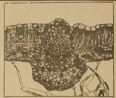
Magnified leaf cross section. Insect sucks up Bidrin with plant juices. This systemic action - keeps working 7 to 14 days.

The roadway for the Crawler-Transporter which will carry the Saturn V and Apollo spacecraft at NASA's Merritt Island Launch Area in Florida will be almost seven feet thick.