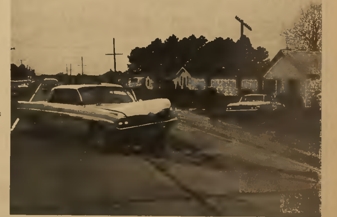
THREE INJURED—Three persons were injured when this 1961 Pontiac (in foreground) and 1962 Ford (in background) collided about six-tenths of a mile north of Rich Square Sunday. The

Rawlings said, "I hate to see it (the bill) killed but there is nothing we can do about it now."