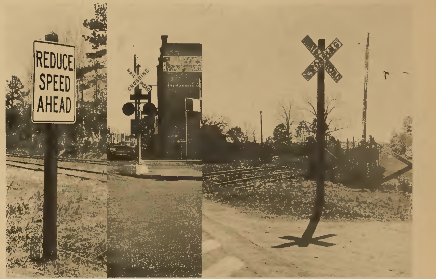
CLOSER LOOK—A blinking warning light will be installed at the railroad crossing just north of Potocasi in the very near future. The light will warn motorists of trains approaching the crossing. The light was the scene of a fatal accident recently and was the site of several accidents over the past year. As the photo above shows,