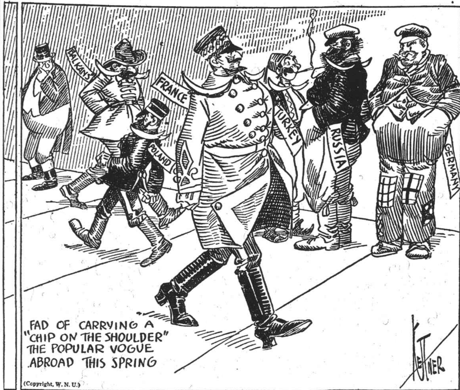
FAD OF CARRYING A "CHIP ON THE SHOULDER" THE POPULAR VOGUE ABROAD THIS SPRING