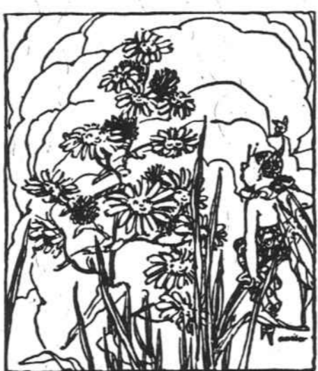
"Nice Autumn Flowers."

And Billie Brownie thought it was a beautiful secret, but he was glad that all could hear the secret who were really interested in Nature.