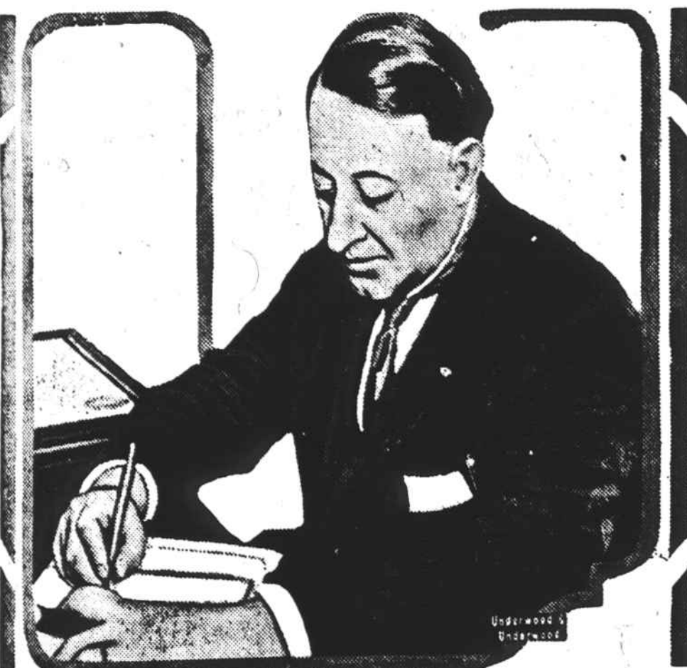
"Jack" C. Walton, governor of Oklahoma, photographed at his desk as he was signing a decree in his warfare against the Ku Klux Klan and the members of the legislature who, he says, are dominated by the klan.