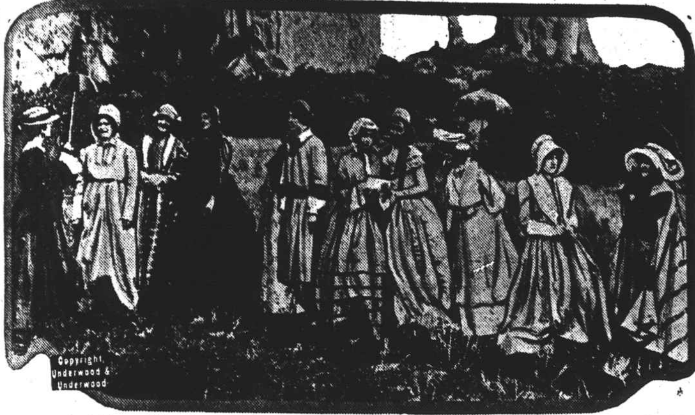
This shows the tableau of the signers of the declaration of principles of 1848 which demanded equal rights for women, at the equal-rights pageant presented by the National Women's party in the Garden of the Gods, Colorado Springs.