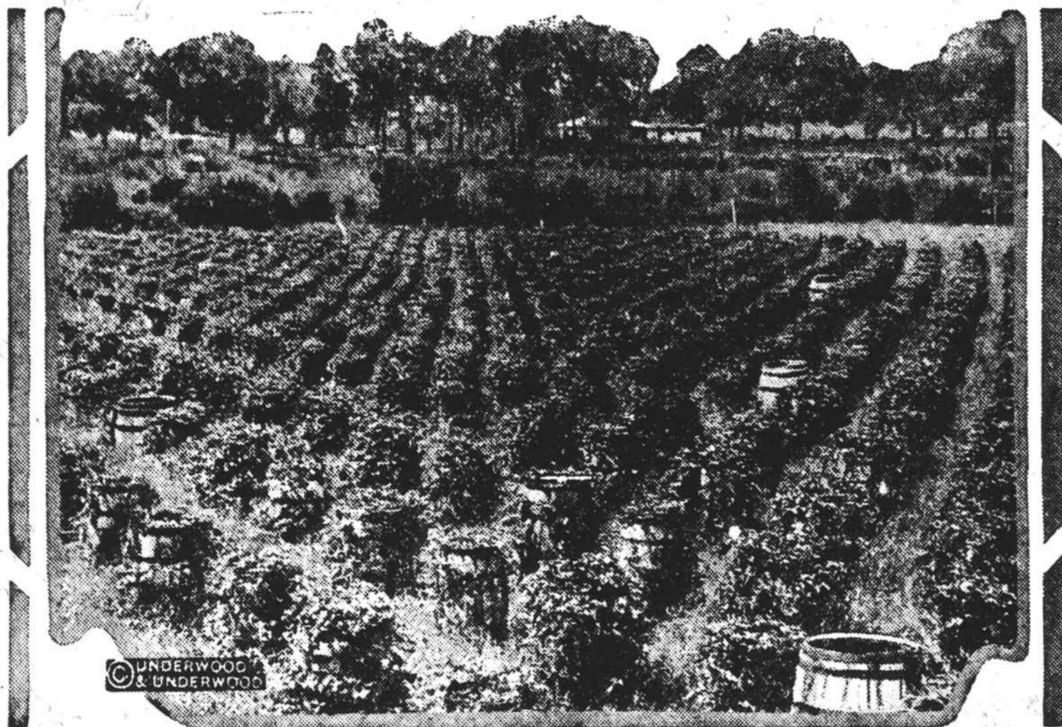
By planting strawberries in barrels better fruit is produced without the berries becoming sanded. It provides better facilities for picking the berries and produces more to the acre. The photograph shows a strawberry farm at Orlando, Fla., where the method is found highly successful.