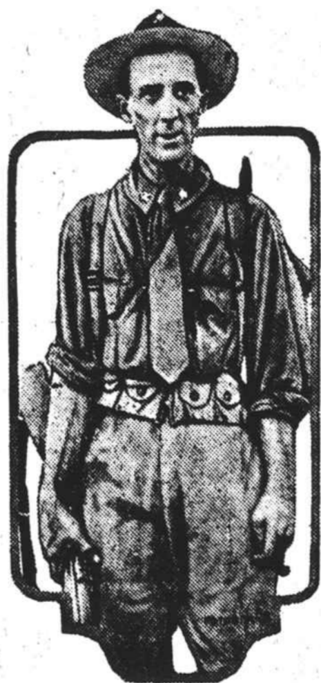
Characteristic photograph of Brig Gen. Smedley D. Butler of the Marine corps, who will soon retire from the service to enter business. He is known as the "fighting Quaker" and is the only man in the corps who holds two congressional medals of honor.