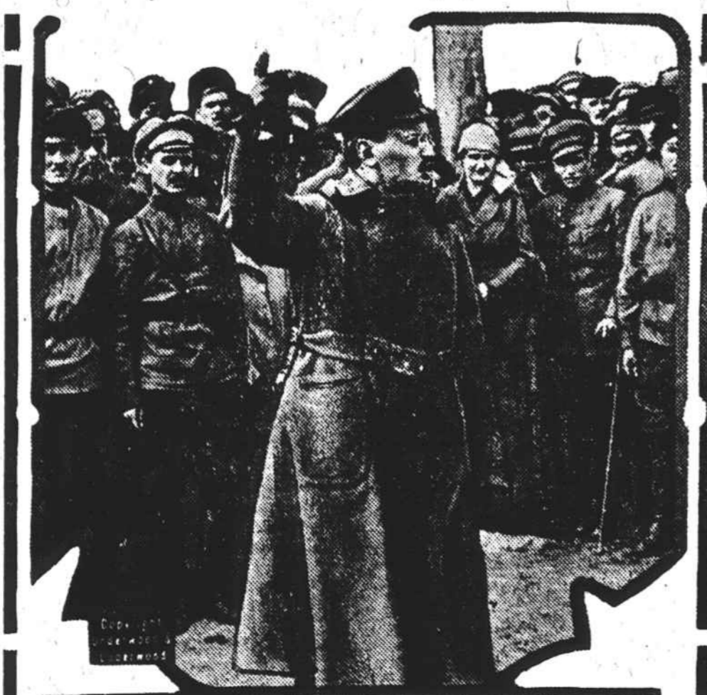
This photograph of Leon Trotsky, the "Napoleon of Russia," addressing a gathering of peasants and workers, has just come to this country and shows the military leader of the Bolshevists is still very much alive.