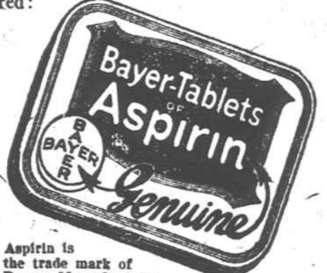
Aspirin is the trade mark of Bayer Manufacture of Monocetlicacidester of Salicylicacid

THERE is nothing that has ever taken the place of Bayer Aspirin as an antidote for pain. Safe, or physicians wouldn't use it, and endorse its use by others. Sure, or several million users would have turned to something else. But get real Bayer Aspirin (at any drugstore) with Bayer on the box, and the word genuine printed in red: