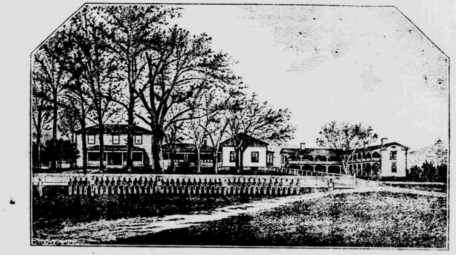
A VIEW OF HORNER'S OLD AND CELEBRATED SCHOOL.

HORNER'S SCHOOL. The school has been under its present management for more than thirty years.