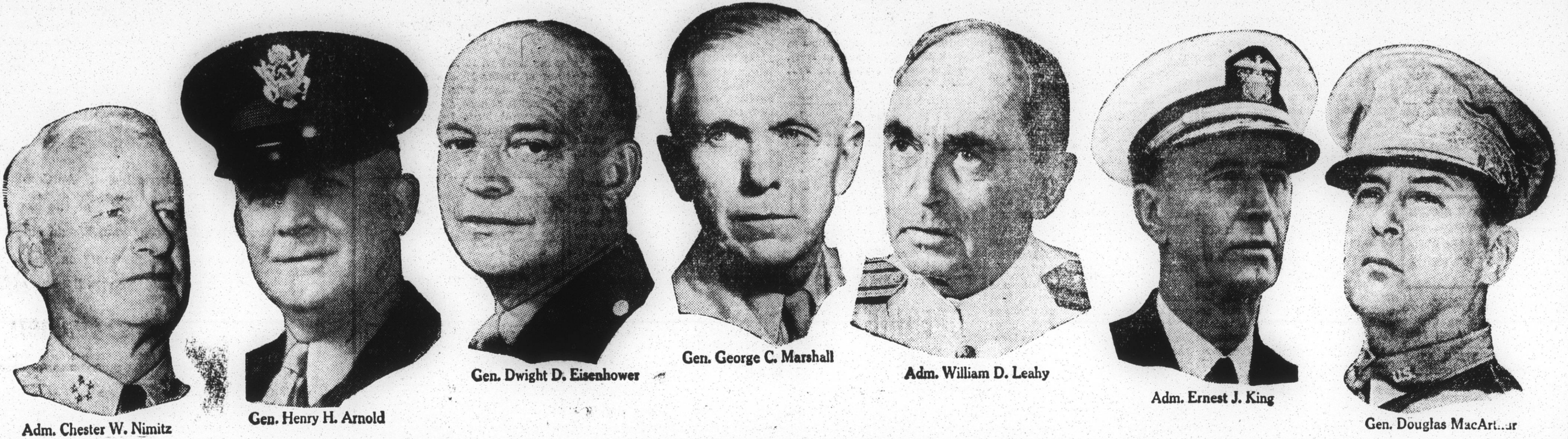
Adm. Chester W. Nimitz

WHAT HAVE YOU DONE---WHAT ARE YOU GOING TO DO?