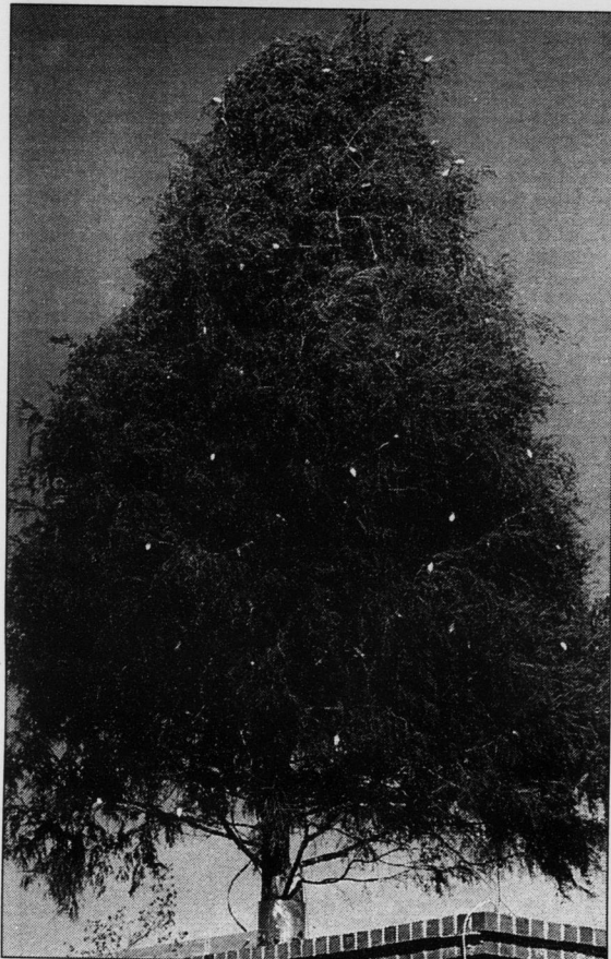
The Chapel Hill Christmas tree sits on the top level of the Rosemary Street Parking Deck. Mayor Ken Broun lighted the tree Dec. 3.