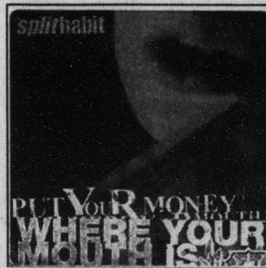
Habit: "Who's got Issues , now?" Shift: "Puns? Puns. Where are