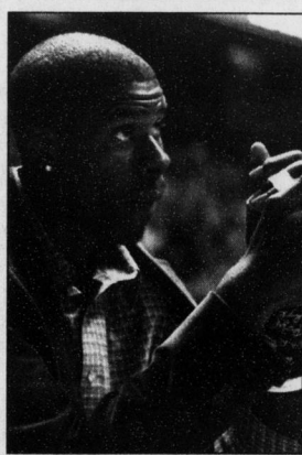
Former Tar Heel, and No. 2 pick in the 2005 NBA draft, Marvin Williams missed Friday's finale at UNC thanks to a broken left hand.