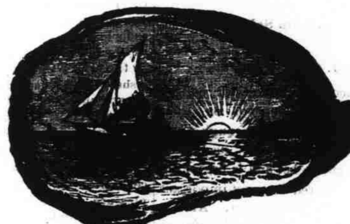
Old SOL Peeping over the Beach at Ocracoke.

Large, Airy, Well Appointed. Pure Water; Invigorating Breezes. A Splendid Piano For The Ladies.