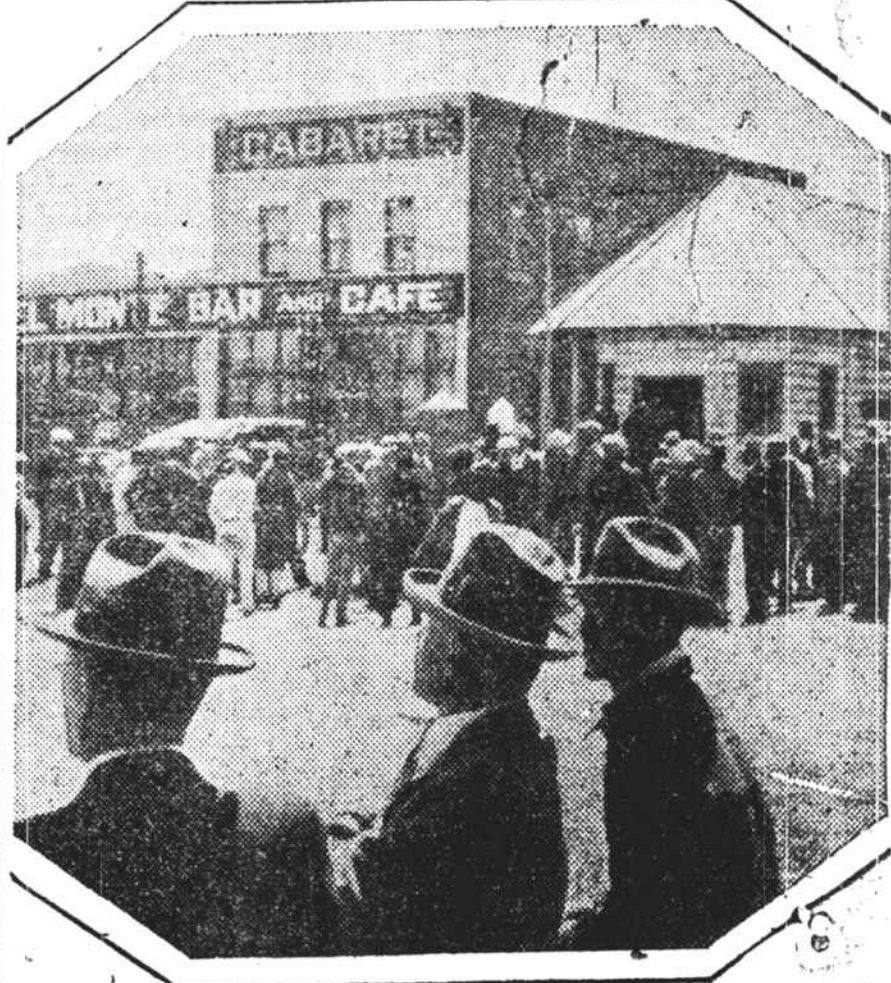
Thirsty Americans, standing on the American side of the border near Naco, Sonora, waiting for hostilities to cease so they can go across, are pictured above. During the battle they were forced to stay on "home grounds."