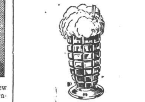
For A Cool Glass of Beer, Drop In at Boyce's Drug Store.

SPRAYERS—WE HAVE complete stock all sizes Myers & Browns Pressure Sprayers. Price lower. Complete stock sprayer repairs. W. A. Miles Hardware Company.