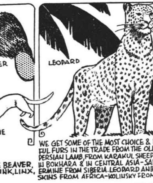
WE GET SOME OF THE MOST CHOICE & BEAUTIFUL FURS IN THE TRADE FROM THE OLD WORLD. PERSIAN LAMB FROM KARAKUL SHEEP RAISED IN BOKHARA & IN CENTRAL ASIA—SABLE AND ERMINE FROM SIBERIA—LEOPARD AND LION SKINS FROM AFRICA—MOLINSKY FROM RUSSIA.