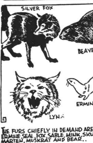
THE FURS CHIEFLY IN DEMAND ARE BEAVER, ERMINE, SEAL, FOX, SABLE, MINK, SKUNK, LYNX, MARTEN, MUSKRAT AND BEAR.