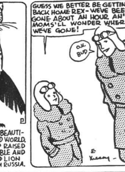
THE FUR INDUSTRY IS AS OLD AS MAN HIMSELF. THE FIRST MEN TO MAKE USE OF FUR WERE THE CAVE MEN OF PREHISTORIC TIMES WHO SECURED THE PELTS OF ANIMALS FOR PROTECTION AGAINST COLD.