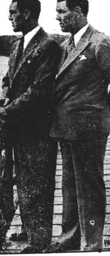
Jack Dempsey, promoter of the heavyweight battle between Max Schmeling, Germany, and Max Baer, California, at New York, June 8, has been a frequent visitor to Schmeling's training camp as pictured here with the German battler.