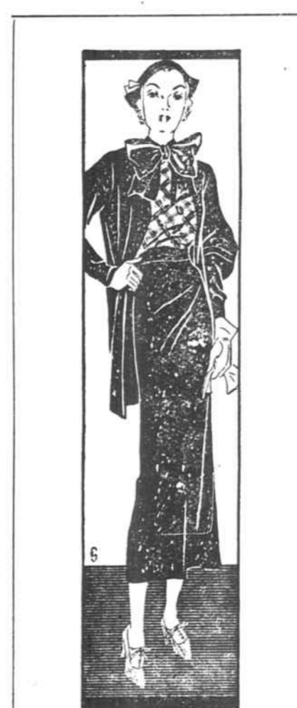
Swagger Suits $5.95, $7.45, $8.75