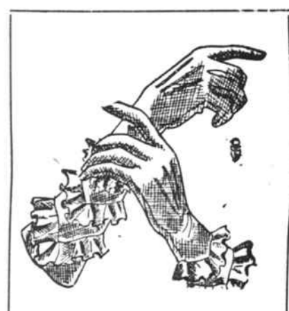
GLOVES In Kids and Doe Skins From $1 to $2.25