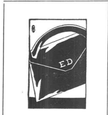
Ladies' Hand Bags From 59c to $2.50