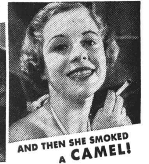
AND THEN SHE SMOKED A CAMEL!

When your energy sags and you feel discouraged—light a Camel. In a few minutes your vigor snaps back and you can face the next move with a smile. Enjoy this wholesome "lift" as often as you want. Camel's costlier tobaccos never ruffle your nerves.