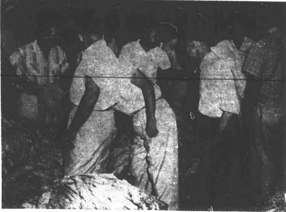
FIRST SALE REGINS AS TOBACCO MARKET OPENS HERE TUESDAY.