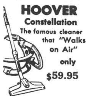
HOOVER Constellation The famous cleaner that "Walks on Air" only $59.95

Wets the floor with clean water and detergent — scrubs it thoroughly — then vacuum dries it instantly! The easiest way to take care of floors you've ever seen.