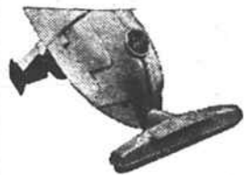
HOOVER Electric Floor Washer

Wets the floor with clean water and detergent — scrubs it thoroughly — then vacuum dries it instantly! The easiest way to take care of floors you've ever seen.