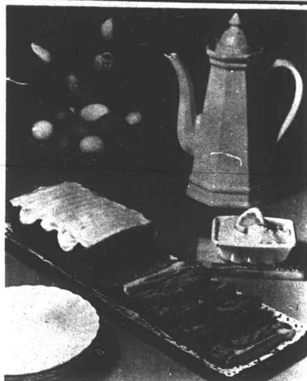
BISHOP'S BREAD . . . A VIENNESE CLASSIC