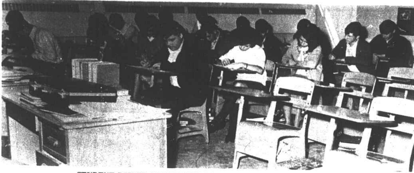
STUDENT DRIVER CANDIDATES TAKING TEST AT JOHN GRAHAM