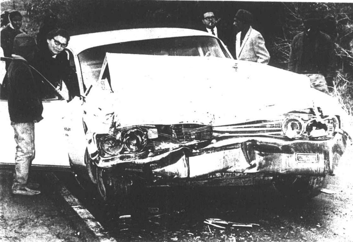
Endicott car is shown in upper picture here Monday morning following two-car wreck. At left of car is Mrs. Dora Robbins, Health Department nurse, rendering assistance to