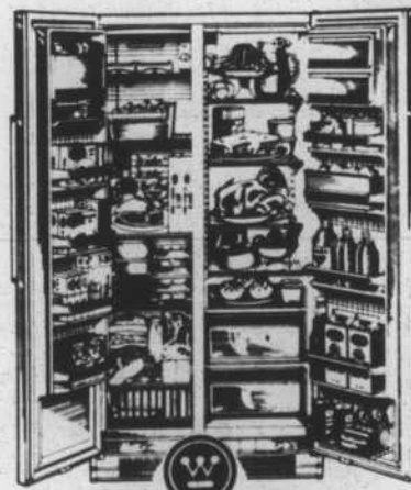
Model RS 194R