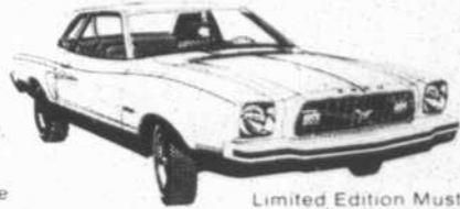
Limited Edition Mustang II 2-Door (Also available on Mustang II 2+2)

of extra retail value at no extra charge* Includes: all Mustang II standard equipment. Plus two-tone lower body, bodyside stripe, unique seat inserts, styled steel wheels, trim rings, brushed aluminum panel applique