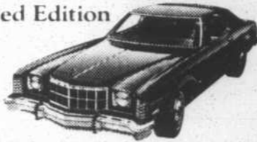
(Car shown with white sidewalls $39 extra)

off standard Elite sticker price Includes: Elite standard equipment. Plus unique wheel covers, special bench seat and trim, special door trim panels, selected matching cloth and vinyl interiors, but excluding wheel lip moldings, door carpet and deluxe steering wheel.