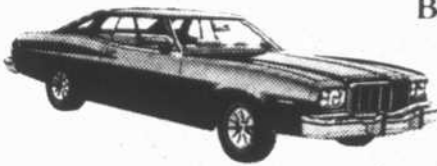
(Car shown with white sidewalls $39 extra)

Includes: all Torino standard equipment. Plus half-vinyl roof, opera windows, accent paint stripe, bodyside molding, dual racing mirrors, sport wheel covers, and specially-selected interior.