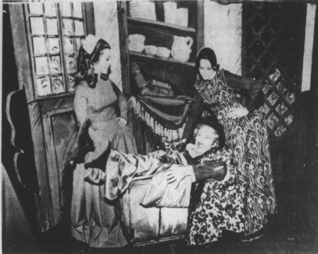
Mistress Ford and Mistress Page ponder the problem of concealing Sir John Falstaff in a laundry basket in order to teach a lesson to the romantic Sir John. This amusing scene is from the National Opera's production "The Merry Wives of Windsor," by Nicolai, which will be performed today [Thursday] at John R. Hawkins Junior High School and Friday at John Graham High School. Their appearances are a part of the enrichment program offered by the Warren County Schools and made possible by a grant from the North Carolina Arts Council.

Thursday, May 27-7:30 p. m., Bible Study and Sharing Group (Mark 5).